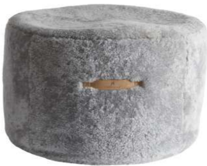
EVA A round pouf in short-haired sheepskin sourced from Australia. The pouf has a cotton quality inner sack filled with soft polystyrene balls making the pouf comfortable to sit on. Decorative handle of imitation leather. Underside in woven textile. Colour: 05/23/136/168/357 Art. No. 632-6040 Size 60x40 cm