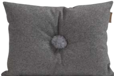
ANITA A cushion made of soft, weaved wool with a decorative button of sheepskin. The filling is polyester. Colour: 05/10/23/39 Art. No. 837-4030 Size 40x30 cm