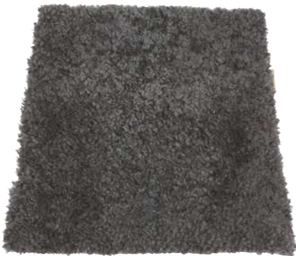
IDA An un-padded square chair cushion. Made of short-haired sheepskin sourced from Australia. The underneath is natural leather. Colour: 25/168 Art. No. 510-4536 Size 45x36 cm