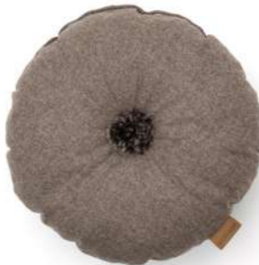
MARITA | NEW A round cushion made of soft, weaved wool with a decorative button of sheepskin. The filling is polyester. Colour: 05/10/23/39 Art. No. 837-4030 Size 40x30 cm