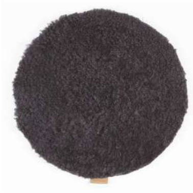
JILL A round chair cushion in sheepskin sourced from Australia. The cushion is padded with comfortable foam. The thickness is approx. 3cm. Colour: 05/10/19/23/25/39/69/136/168/357 Art. No. 520-0036 Size 36 cm Ø