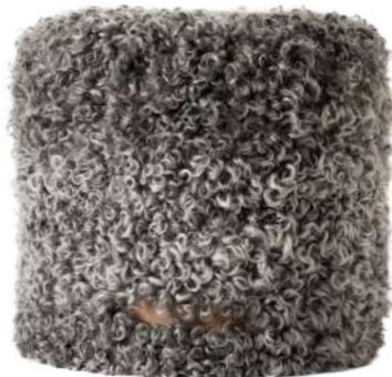
IDUN A round pouf in genuine Gotland wool, known for its unique curls and lustrous texture. Each pouf is a unique piece, showcasing the natural beauty and variation of sheepskin. Decorative handle made of imitation leather. The underneath is made from weaved fabric. Colour: 03 Art. No. 696-4040 Size 40x40 cm