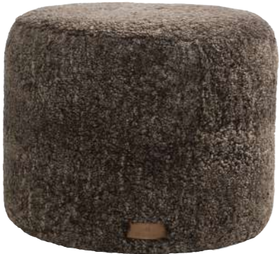
FRIDA I in Several Sizes A round pouf in short-haired sheepskin sourced from Australia. Underside in woven textile. Colour: 05/10/19/23/25/39/69/136/168/357 Art. No. 605-4040 Size 40x40 cm Art. No. 605-5040 Size 50x40 cm