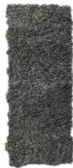
VIOLET Rectangular seat cushion in sheepskin that fits nicely on a bench. Thickness 1.5 cm. Colour: 05/69/136/168 Art. No. 570-8030 Size apx. 80x30 cm Art. No. 570-1030 Size apx. 100x30 cm