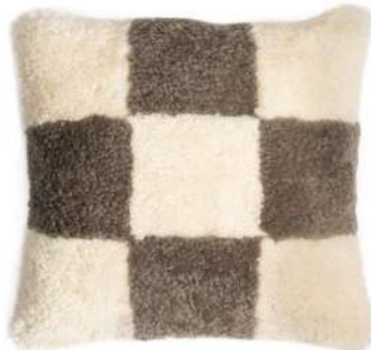
RUTH A checkered cushion in sheepskin. The back made of weaved wool. Hidden zip. Colour: 105/223/325/525 Art. No. 817-4040 Size 40x40 cm