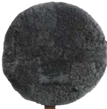
FIA A round padded chair cushion in short-haired, patchwork sheepskin. The underneath is made of weaved fabric. The thickness is approx. 3cm. Colour: 05/10/19/25/39/69/136/357 Art. No. 590-0036 Size 36 cm Ø