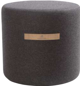
SARA I in Several Sizes A round pouf in woven wool. Handle in imitation leather. Underside in woven textile. Colour: 05/10/23/39 Art. No. 614-4040 Size 40x40 cm Art. No. 614-6040 Size 60x40 cm