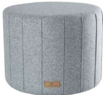
ANJA A round pouf in woven wool. Decorative handle made of imitation leather and has decorative stitching on the surface. The underneath is made from weaved fabric. Colour: 05/10/23/39 Art. No. 629-5040 Size 50x40 cm