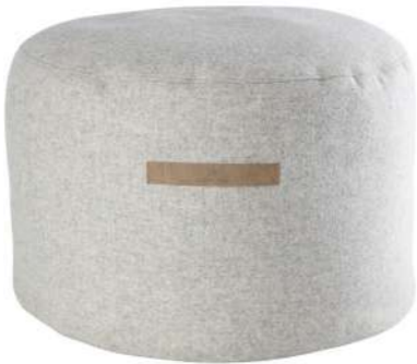
HANNA A round pouf in woven wool. The pouf has a cotton quality inner sack filled with soft polystyrene balls making the pouf comfortable to sit on. Decorative handle of imitation leather. Underside in woven textile. Colour: 05/10/23/39 Art. No. 636-6040 Size 60x40 cm