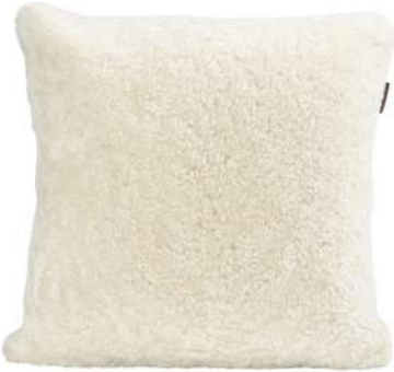
ALICE | in Several Sizes A cushion made of soft, short-haired sheepskin. Hidden zip. Colour: 05/10/19/23/25/39/69/357 Art. No. 800-5050 Size 50x50 cm Art. No. 800-6040 Size 60x40 cm

Our cushions are delivered with an inner cushion in a polyester mix filled with 50% silicone padding and 50% duck feathers meaning that the cushion feels fluffy while still holding its shape.