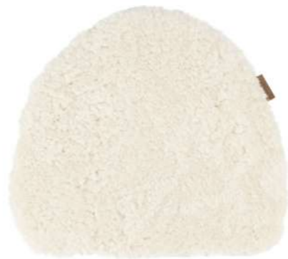
JUDITH A chair cushion in sheepskin sourced from Australia. The cushion is padded with comfortable foam. The thickness is approx. 3cm. Colour: 05/10/19/23/25/39/69/136/168/357 Art. No. 521-3436 Size 34x36 cm