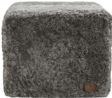
EMMA I in Several Sizes A rectangular pouf in short-haired sheepskin sourced from Australia. Underside in woven textile. Colour: 05/10/19/23/25/39/69/136/168/357 Art. No. 602-4040 Size 40x40 cm Art. No. 602-5040 Size 50x40 cm

The pouf has a firm base so it hold its shape and a foam top for optimal comfort. All with a removable cover with a drawstring at the bottom.