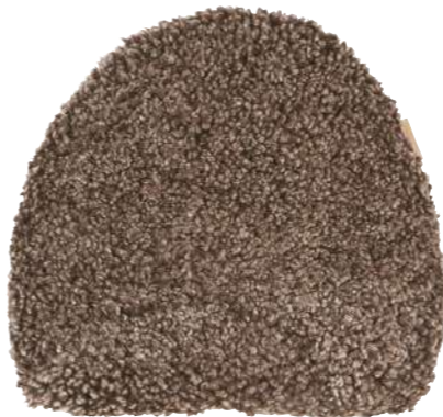
ELLEN An un-padded chair cushion made of soft short-haired sheepskin sourced from Australia. The underneath is natural leather. Colour: 05/10/19/23/25/39/69/136/168/357 Art. No. 511-3436 Size 34x36 cm