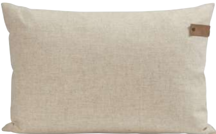
TINA | in Several Sizes A cushion made of soft, weaved wool with a decorative leather imitation handle. Hidden zip. Colour: 05/10/23/39 Art. No. 827-6040 Size 60x40 cm Art. No. 827-5050 Size 50x50 cm