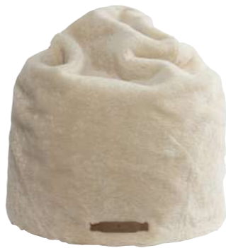
LILLY A soft and comfortable beanbag made of short-haired sheepskin sorced from Australia. The beanbag has an inner sack made of weaved cotton quality fabric. It is filled with polystyrene balls making it comfortable to sit on. The underneath is made from weaved fabric. Colour: 05/23/168/357 Art. No. 635-6010 Size 100x60 cm