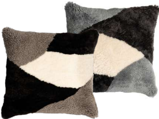
HILLE A cushion in sheepskin with with an all-over print. The back made of weaved wool. Hidden zip. Colour: 625/323 Art. No. 813-5050 Size 50x50 cm