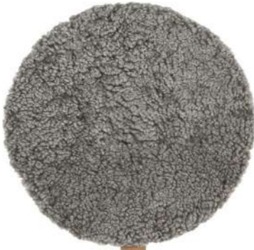
IDA An un-padded round chair cushion. Made of short-haired sheepskin sourced from Australia. The underneath is natural leather. Colour: 05/10/19/23/25/39/69/136/168/357 Art. No. 500-0036 Size 36 cm Ø