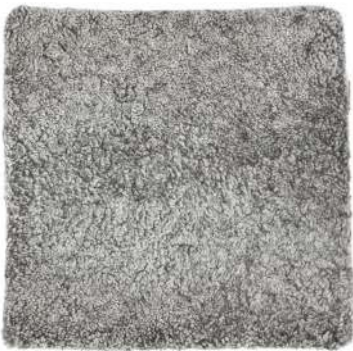
JILL A square chair cushion in sheepskin sourced from Australia. The cushion is padded with comfortable foam. The thickness is approx. 3cm. Colour: 05/10/19/23/25/39/69/136/168/357 Art. No. 520-4040 Size 40x40 cm

Sheepskins and wool will not only add a warm feeling to your home, it also gives the chair a comfortable feel. You will find seat cushions that are provided with soft padding and have an anti-slip or all natural without padding and an underside in brushed suede that holds the seat cushion in place.