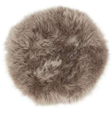
MOLLY A round chair cushion made of long-haired sheepskin sourced from Australia. Stained with different beautiful hues. The underneath is natural leather. Colour: 20/40/55/59/136/168/401 Art. No. 560-0036 Size 36 cm Ø