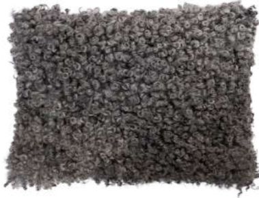
FAYE A cushion in genuine Gotland wool, known for its unique curls and lustrous texture. Each cushion is a unique piece, showcasing the natural beauty and variation of sheepskin. The back made of weaved wool. Hidden zip. Colour: 03 Art. No. 819-4030 Size 40x30 cm