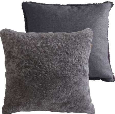
LINA | in Several Sizes A cushion with the front made of soft short-haired sheepskin. The back made of weaved wool. Hidden zip. Colour: 05/10/23/25/168/357 Art. No. 811-4040 Size 40x40 cm Art. No. 811-4030 Size 40x30 cm Art. No. 811-6040 Size 60x40 cm Art. No. 811-6025 Size 60x25 cm