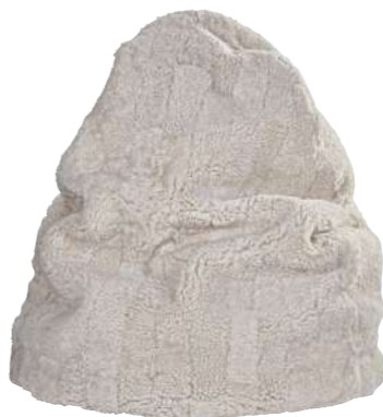
LENA A soft sheepskin beanbag made of left over sheepskin materials in a patchwork pattern. The beanbag has an inner sack made of weaved cotton quality fabric. It is filled with polystyrene balls making it comfortable to sit on. The underneath is made from weaved fabric. Colour: 05/23/168/357 Art. No. 692-6010 Size 100x60 cm