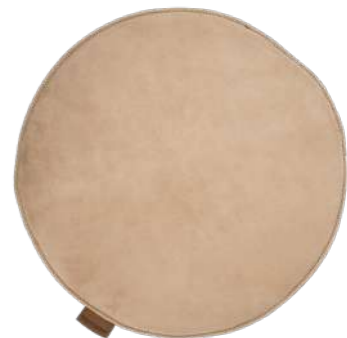
SINDRA A padded round chair cushion. The top of the cushion is made of sheepskin seude and the underneath in woven fabric. The thickness is approx. 2cm. Colour: 25/52 Art. No. 321-0036 Size 36 cm Ø