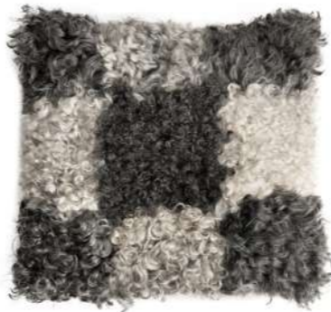
RUTE A checkered cushion in genuine Gotland wool, known for its unique curls and lustrous texture. Each cushion is a unique piece, showcasing the natural beauty and variation of sheepskin. The back made of weaved wool. Hidden zip. Colour: 03 Art. No. 809-4040 Size 40x40 cm