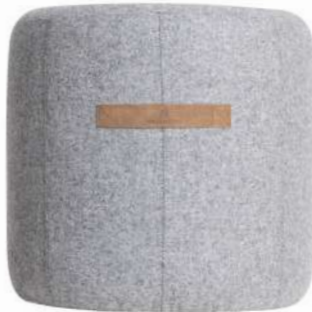
ZOE A round pouf in woven wool. Decorative handle made of imitation leather and has decorative stitching on the surface. The underneath is made from weaved fabric. Colour: 05/10/23/39 Art. No. 612-4040 Size 40x40 cm