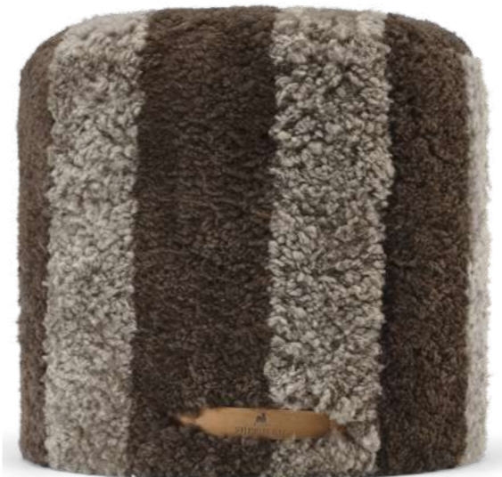
Randy I NEW A round pouf covered in short-haired sheepskin sourced from Australia. The underside is made from a durable woven textile. Decorative stripes run around the sides Colour: 325 /525 Art. No. 609-4040 Size 40x40 cm