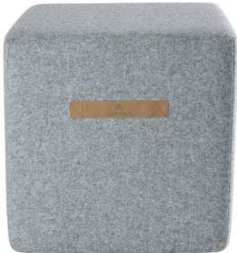
ANNA A rectangular pouf in woven wool. Handle in imitation leather. Underside in woven textile. Colour: 05/10/23/39 Art. No. 606-4040 Size 40x40 cm