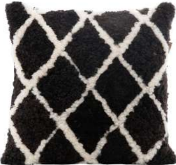
SCARLETT A chequered cushion in sheepskin. The back made of weaved wool. Hidden zip. Colour: 136/357 Art. No. 814-4040 Size 40x40 cm