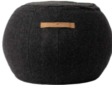
VISKAN A round pouf in woven wool. The pouf has a cotton quality inner sack filled with soft polystyrene balls making it comfortable to sit on. Decorative handle made of imitation leather and has decorative stitching on the surface. Colour: 05/10/23/39 Art. No. 613-4045 Size 40x45 cm