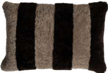
RAND A striped cushion in sheepskin. The back made of weaved wool. Hidden zip. Colour: 105/223/325/525 Art. No. 821-6040 Size 60x40 cm