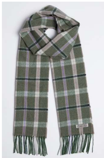
GREEN & MINK CHECK SCARF 4392/C3