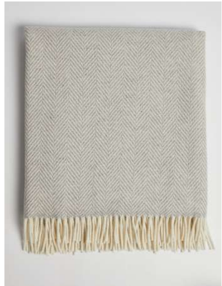
CLARE ISLAND THROW 4170/C3