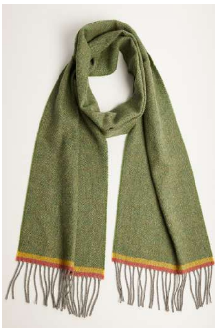
GREEN SCARF 4380/D4