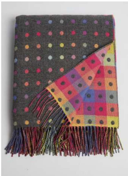
GREY RAINBOW THROW