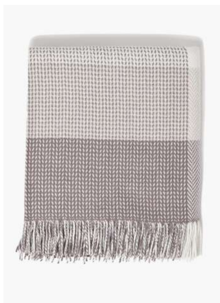
DÚN BRISTE THROW