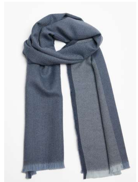
MAJENTA/ FLAME SCARF