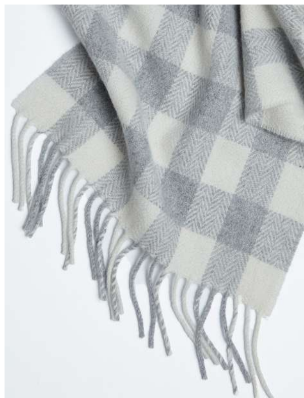
PERAL GREY CHECK