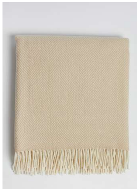
KEEM BAY THROW