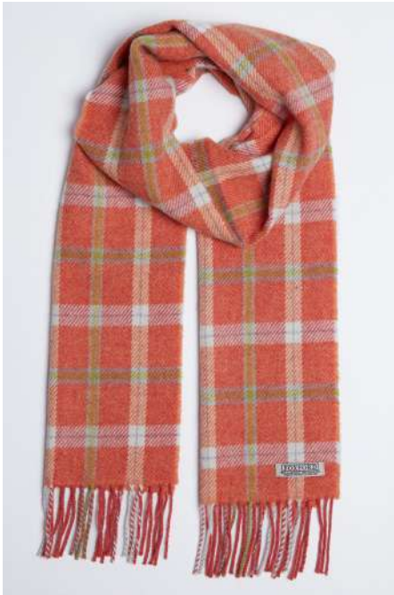
ORANGE CHECK SCARF

Dimensions: 30 x 210 cm / 12 x 82 inch 100% Lambswool