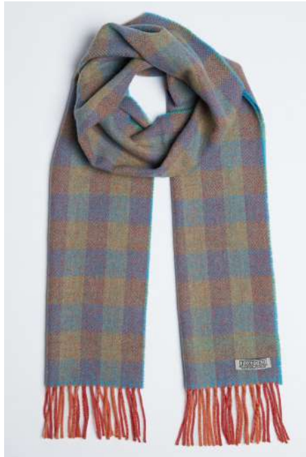
ORANGE/BLUE SMALL CHECK SCARF