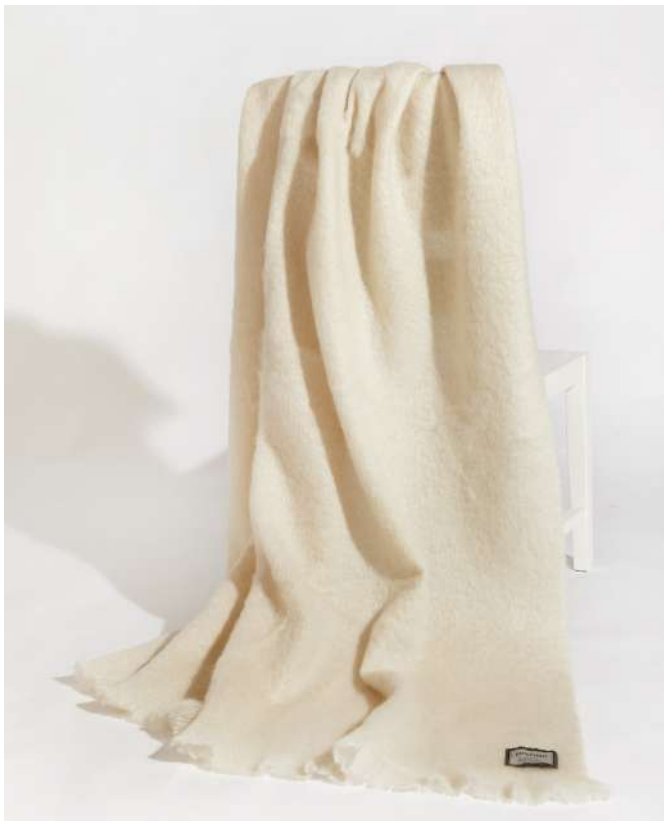
OFF WHITE THROW