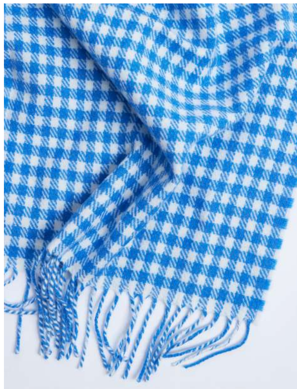
CORNISH BLUE GINGHAM