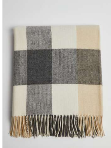
CLASSIC CHECK THROW