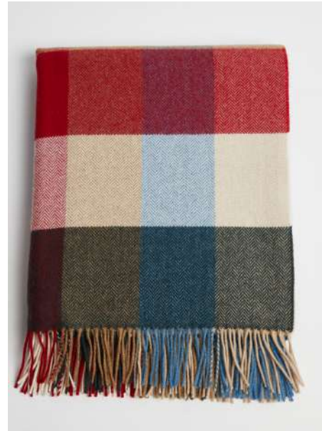
WOODLANDS AVENUE THROW