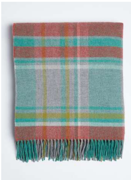
SPRAOI THROW 4401/B2