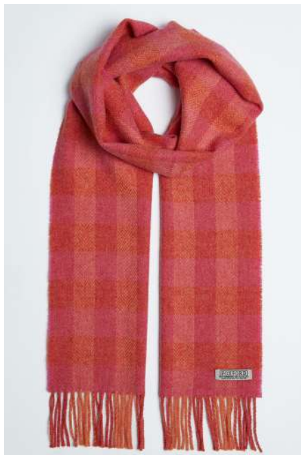
ORANGE & PINK CHECK SCARF 4394/C3