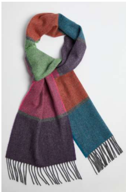
CONTEMPORARY STRIPE SCARF 3697/AI

Dimensions: 30 x 210 cm / 12 x 82 inch 100% Lambswool