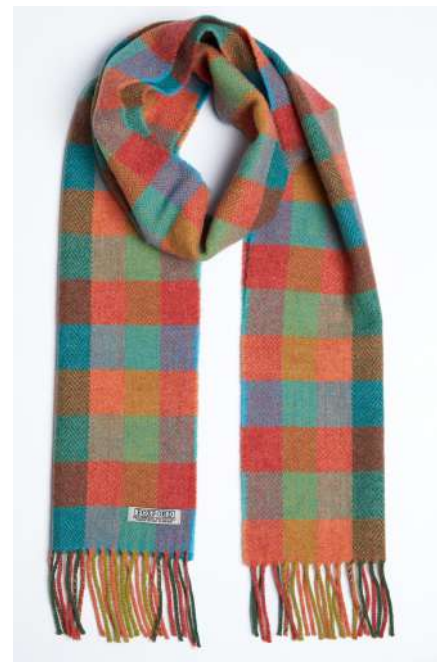
MULTI-COLOUR SMALL BLOCK SCARF 4393/AI