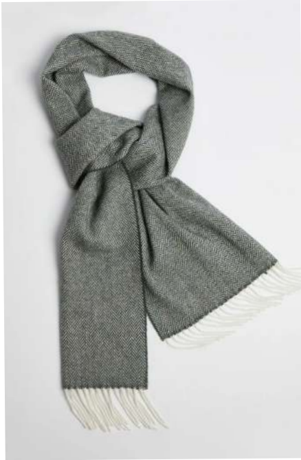
DARK GREEN HERRINGBONE SCARF 359I/G7