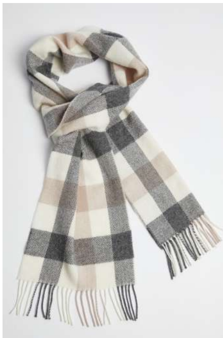
CLASSIC BLOCK CHECK SCARF 3420/B2

Dimensions: 30 x 210 cm / 12 x 82 inch 100% Lambswool