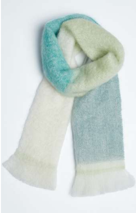
GREEN & LIME SCARF