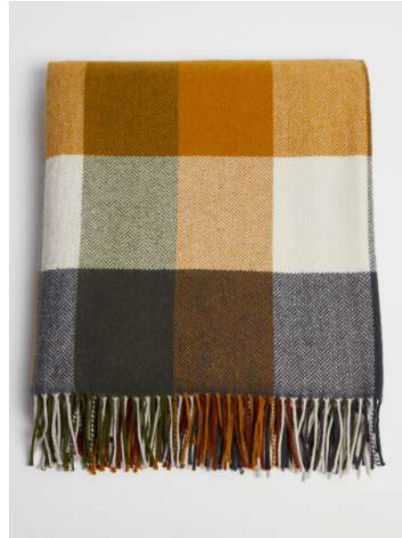
ARDAGH THROW 4308/C3