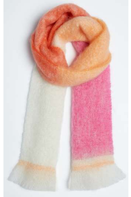
PINK & ORANGE SCARF