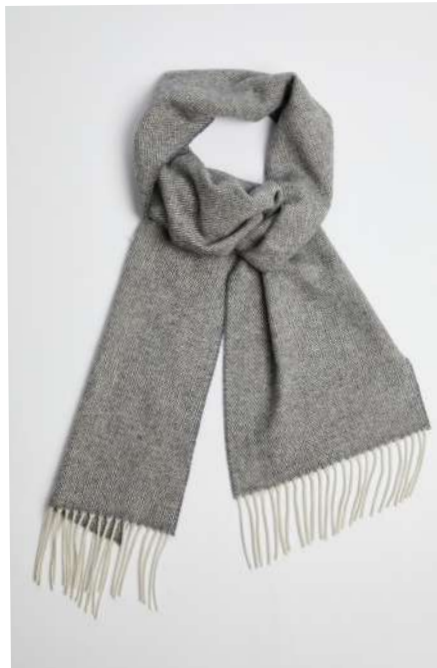
GREY HERRINGBONE SCARF 359I/D4