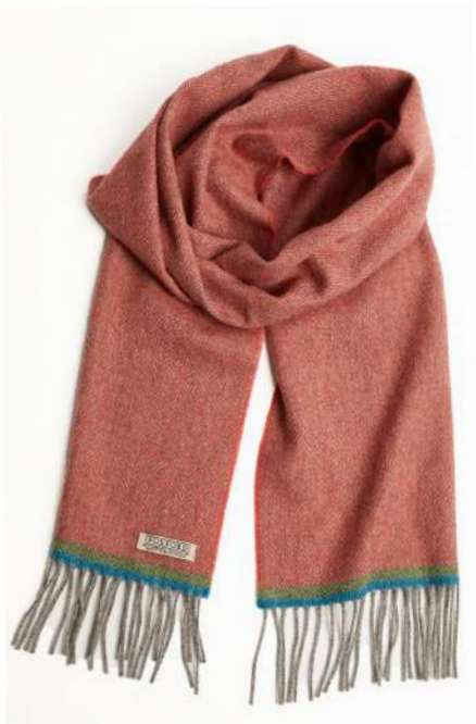
TERRACOTTA SCARF 4380/B2