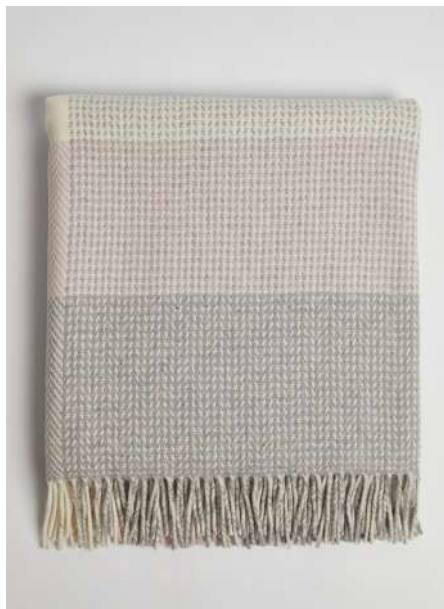
PORT MOR THROW

Dimensions: 140 x 180 cm / 55 x 71 inch 95% Lambswool, 5% Cashmere