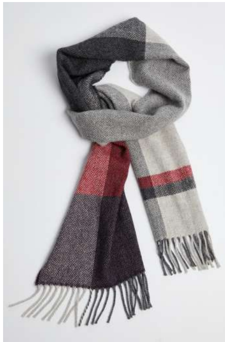
AUBERGINE BLOCK STRIPE SCARF 4365/B2