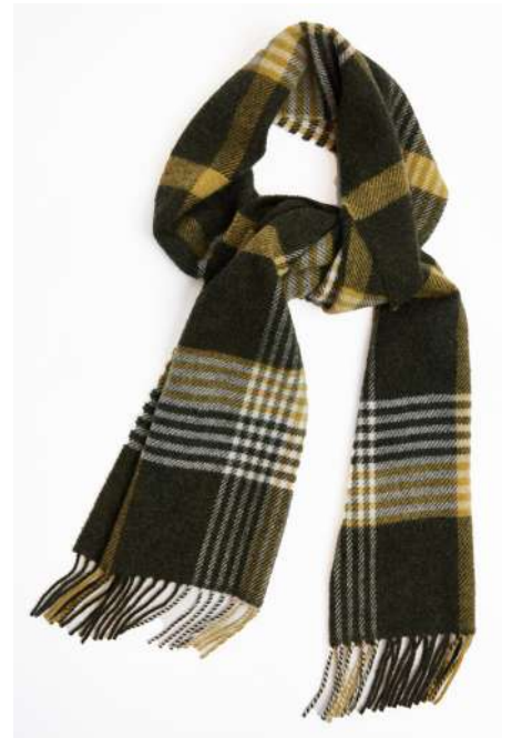
BRÓD SCARF 439I/AI