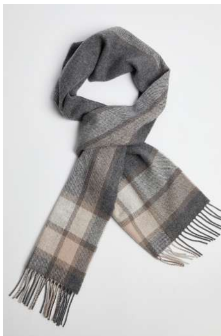
OXFORD CHECK SCARF 3585/A1