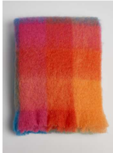
COLOUR BLOCK THROW