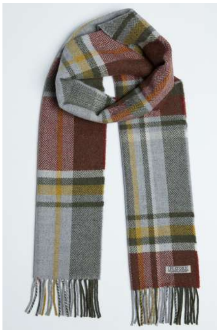
RUST & GREEN TARTAN SCARF 4395/AI

Dimensions: 30 x 210 cm / 12 x 82 inch 100% Lambswool