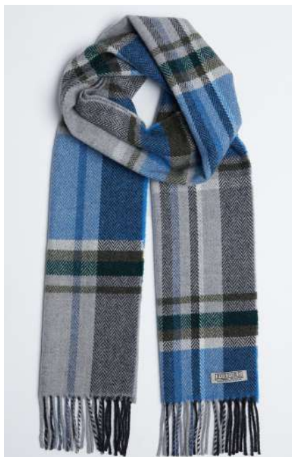
BLUE & GREY TARTAN SCARF