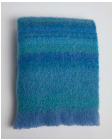
WILD ATLANTIC THROW