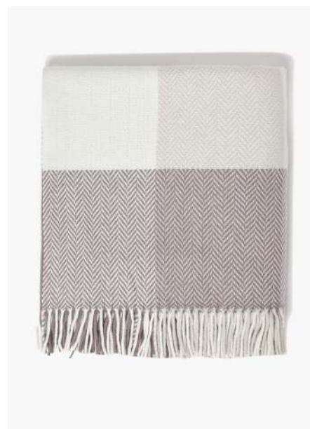
DÚN NA RÍ THROW