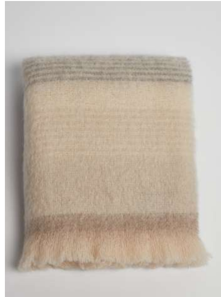
CLASSIC OMBREID THROW