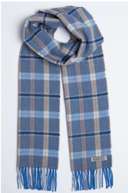
BLUE & MINK CHECK SCARF