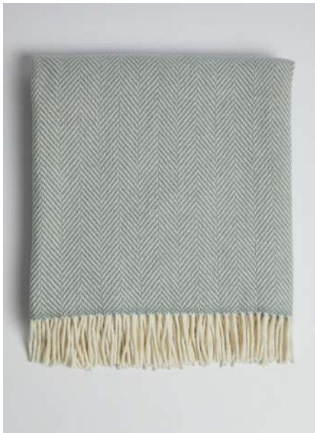
ACHILL THROW 4170/J9