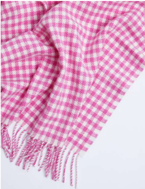
CERISE PINK GINGHAM