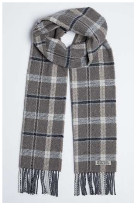
GREY & MINK CHECK SCARF 4392/B2