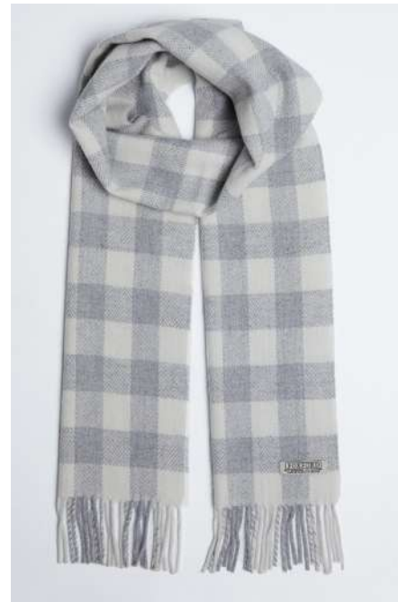
GREY & WHITE CHECK SCARF 4394/D4