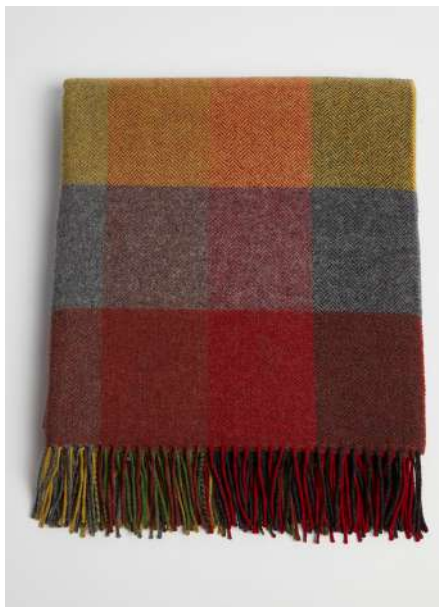
FOREST DRIVE THROW