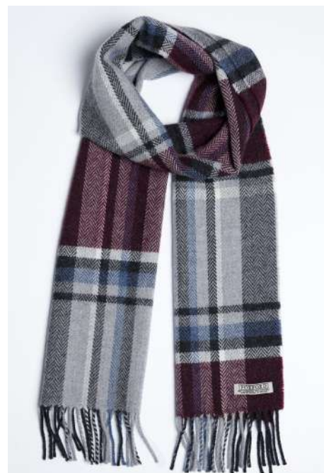
MAROON & GREY TARTAN SCARF 4395/B2