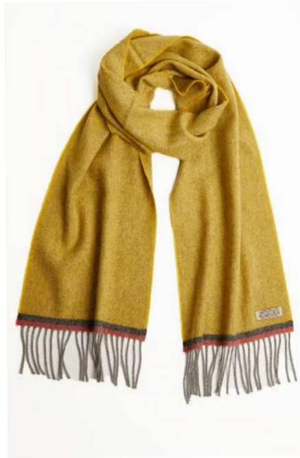
GOLD SCARF 4380/C3