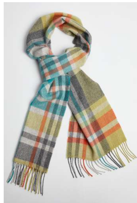
BRIGHT BORDER CHECK SCARF 4270/C3