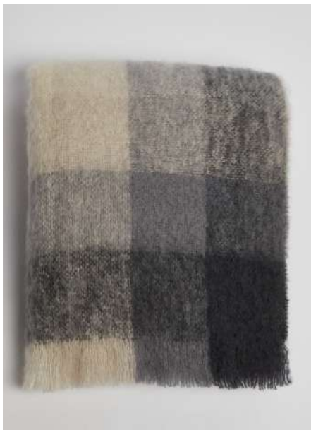
CLASSIC CHECK THROW