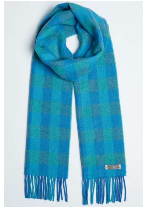
BLUE & GREEN CHECK SCARF