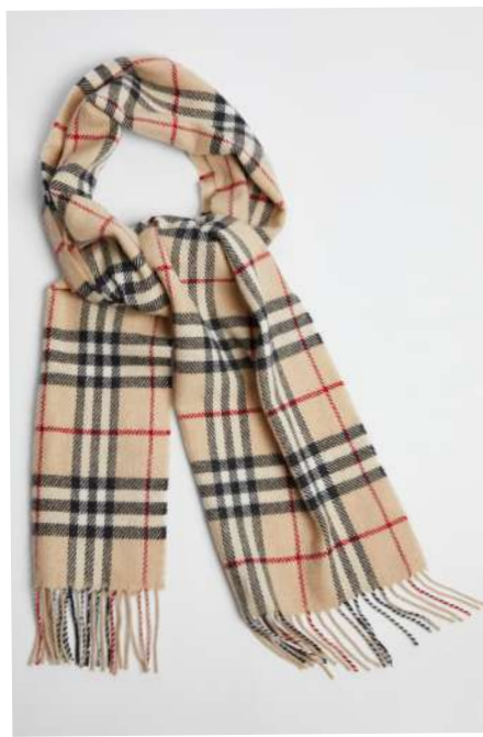
FAWN TARTAN SCARF 3466/AI