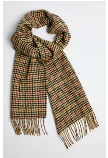
TRADITIONAL HOUNDSTOOTH SCARF 3550/AI