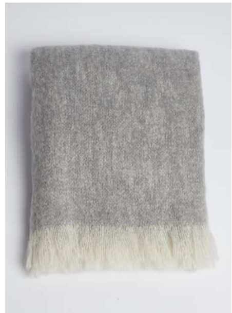
CROAGH PATRICK THROW