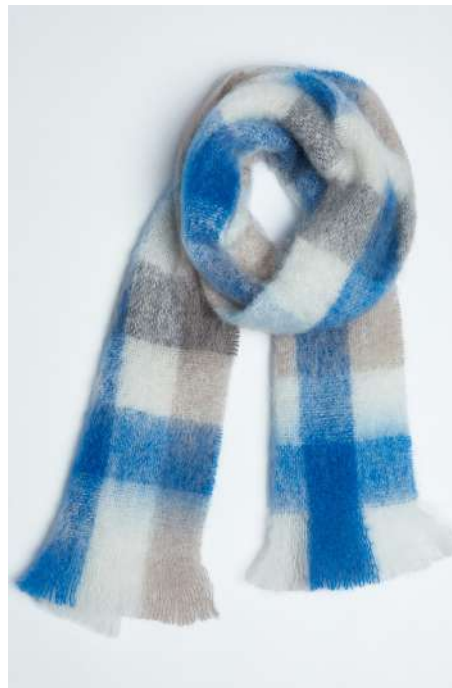
BLUE & MINK SCARF