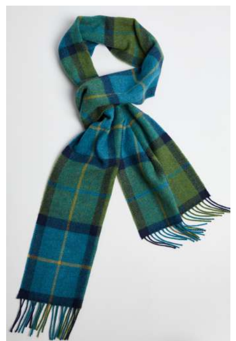
LEAF/TURQUOISE CHECK SCARF 3538/AI