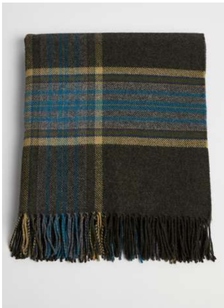
BLACKSOD BAY THROW