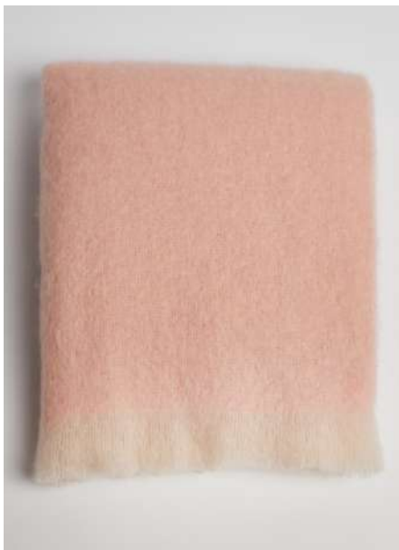
CHERRY BLOSSOM THROW