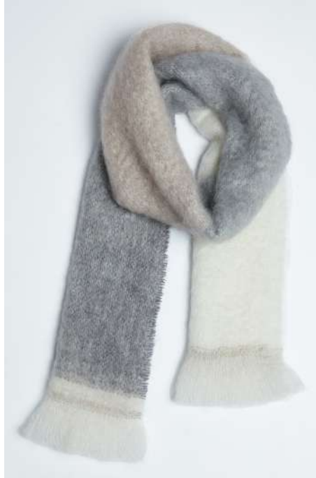
GREY & MINK SCARF