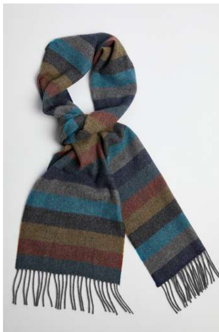
MULTISTRIPE SCARF 4064/AI