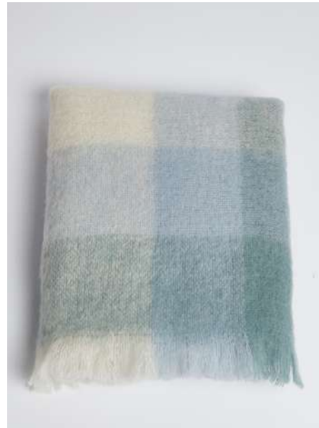
CLEW BAY THROW