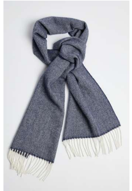
DARK BLUE HERRINGBONE SCARF 359I/C3