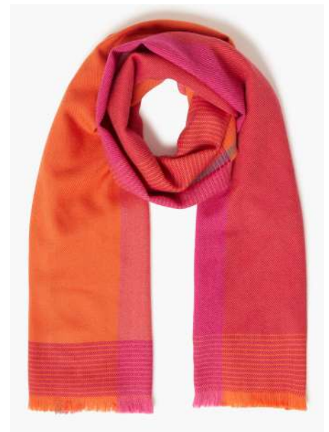
PINK TWILL SCARF