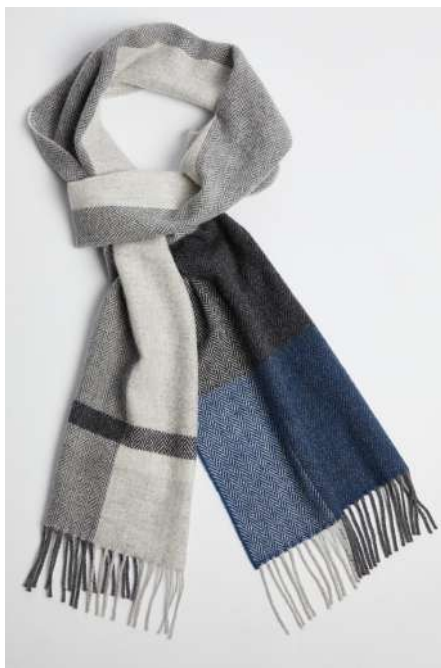
NAVY BLOCK SCARF 4365/D4