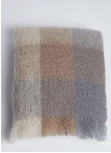
BARNA WOODS THROW