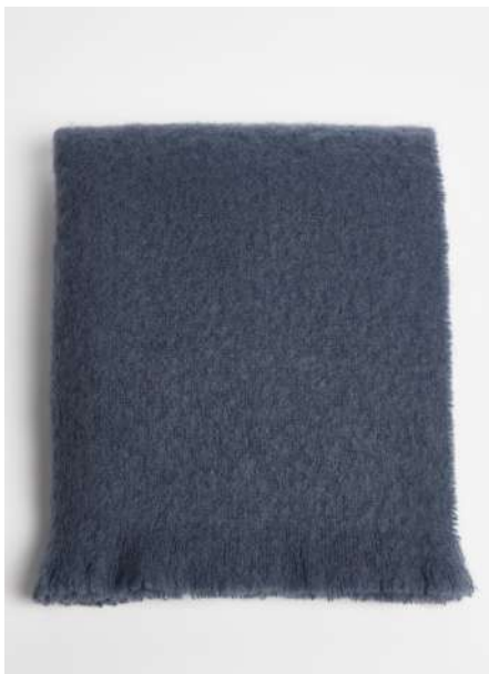
HAGUE BLUE THROW